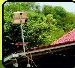
70% Solar Lights are used here