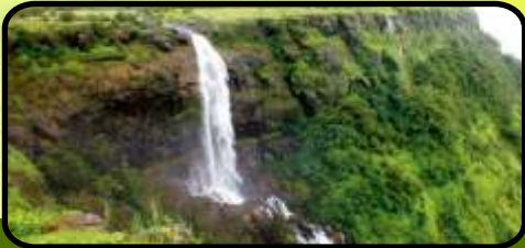
Nearest Nature's Beauty - Madhe Ghat