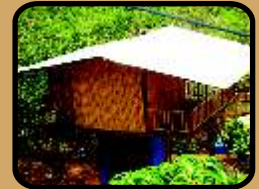
Machan – Tree House